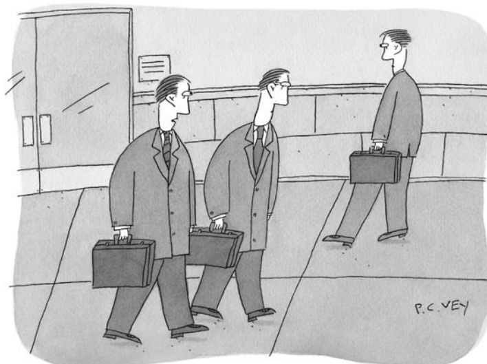
“My media strategy has always been to go home and watch TV.”